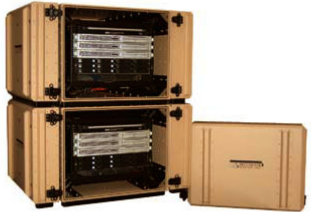
Figure 1: SecureTek's Modular Tech Pak Data Center

With one controller unit and up to four JBOD units (each 2U) the expansion capabilities meet all of our customers' needs. The unique battery-free cache in Dot Hill's products also lend themselves well to remote environments requiring higher reliability and less maintenance. The initial Tech Pak was released and has been well received using Dot Hill's 2730; however, we are very excited to release the next generation of the Tech Pak using the 5730. The higher performance 5730, with NEBS and MIL-STD 810f certifications as well as double expansion capacity of the 2730, is a perfect fit for the rugged and remote military applications targeted for the Tech Pak product."